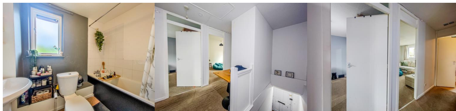
TOP FLOOR 515 sq.ft. (47.8 sq.m.) approx.